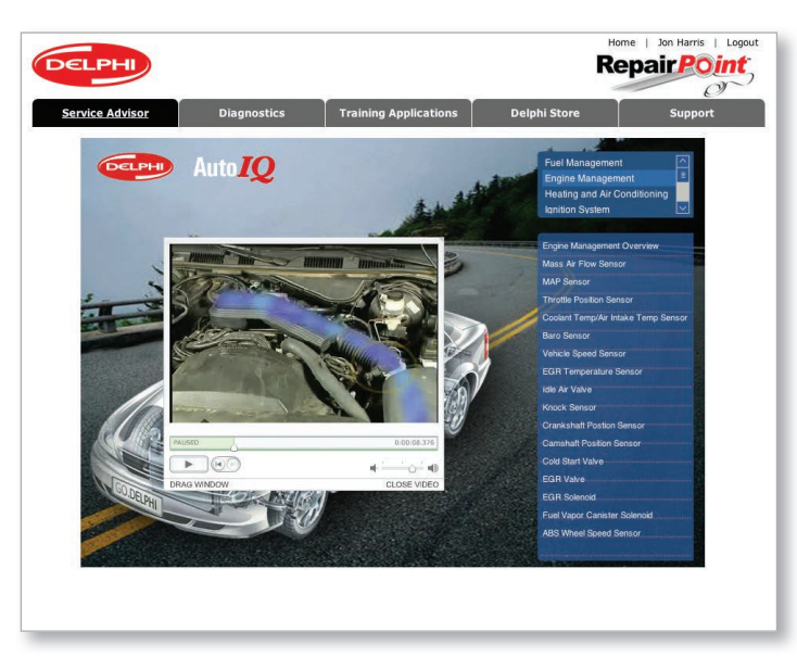
AutoIQ videos explain component functions in eight major vehicle systems